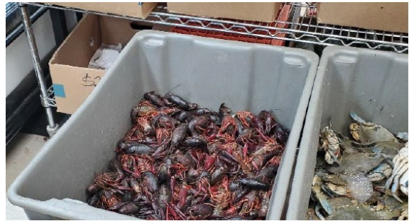
Prohibited red swamp crayfish for sale at a grocery store.