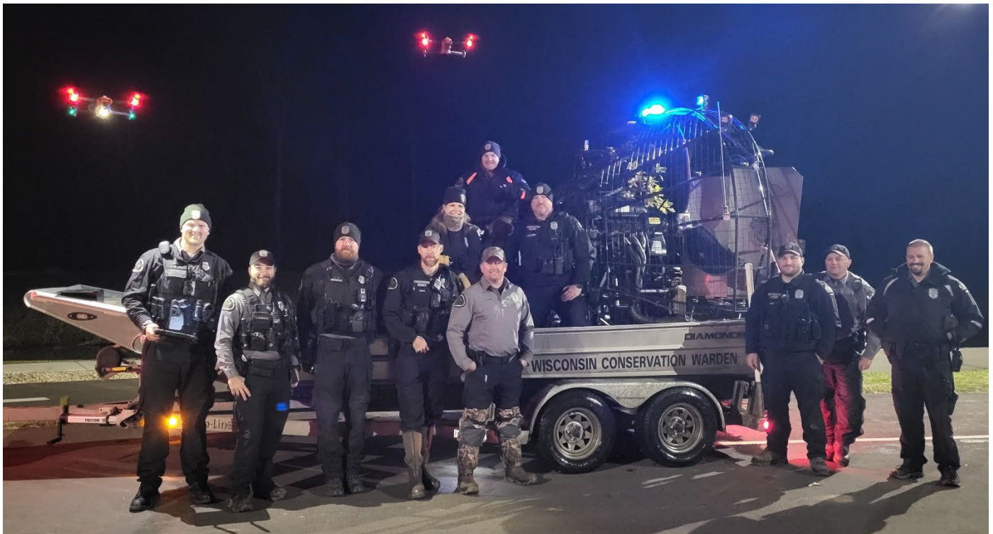
The Unmanned Aircraft Systems (UAS) Mission Ready Team spent two days training in Boscobel, WI on several skill building tasks. A portion of the training included partnering with airboat operators from the Mississippi River and Dodgeville teams for a nighttime scenario involving a missing hunter on the Wisconsin River.

Funding and Staffing Issues - identify any recent developments in funding, staffing, and diversity in employment issues and describe what prompted these developments and how improvements in funding, staffing and diversity in employment were accomplished.