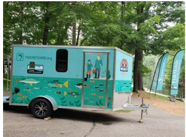
Fishmobile Mobile First Catch Center