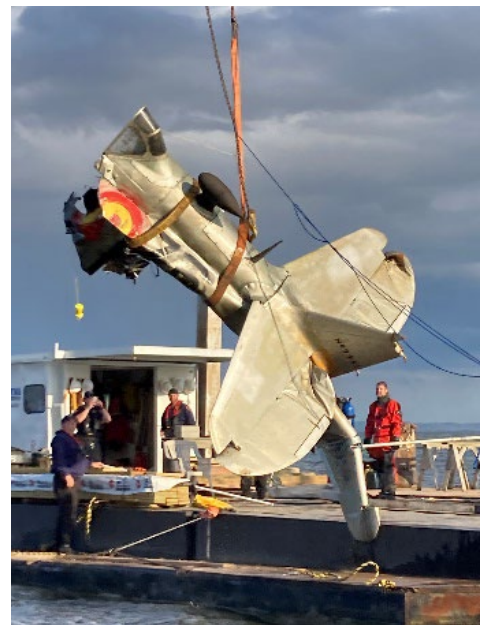
Recovery efforts from plane crash at Lake Winnebago