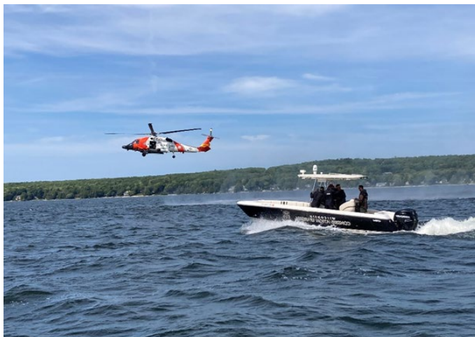
BOSAR Training – Sturgeon Bay August 2023