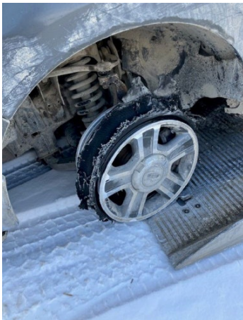
Result of Spike Belt Deployment