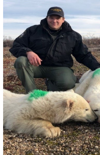
CO with Tranquilized Polar Bears